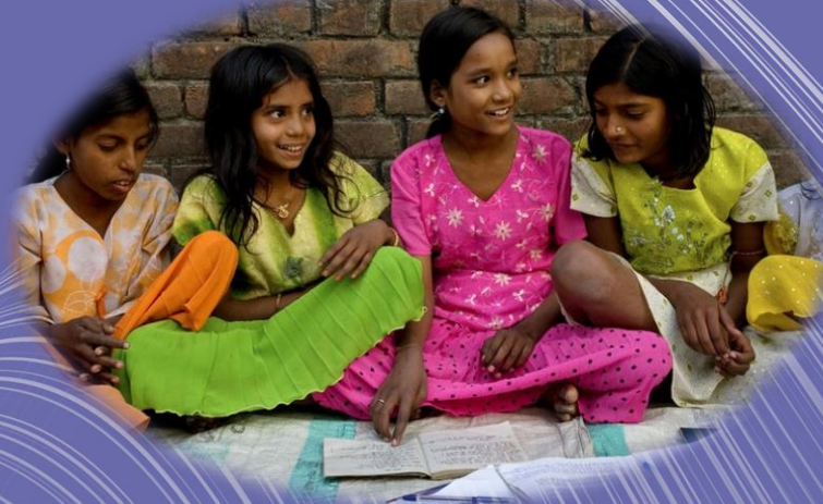
Junior Youth Spiritual Empowerment program: 12-14