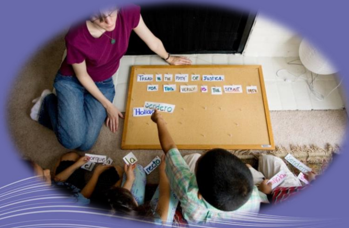
Children class program: 5-11