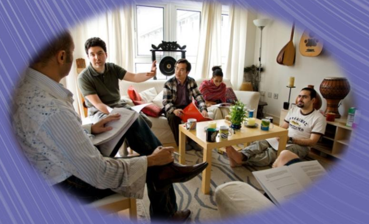
Study circle: 15 and above